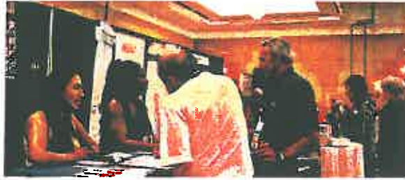
7:30 a.m. – 6:30 p.m. Exhibitor Showcase Open