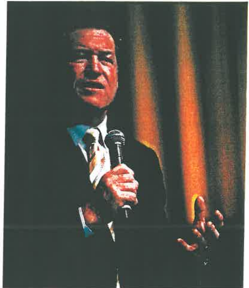
8:45 – 11:00 a.m. OPENING KEYNOTE PRESENTATION

Deadline for submissions is Wednesday, July 17, 2019. All applicants will be notified prior to the Annual Conference as to the winner.