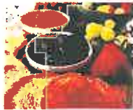
7:30 – 8:30 a.m. Continental Breakfast with the Exhibitors